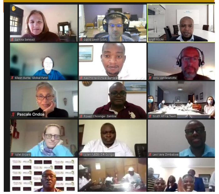
Cape Town 2022 Integration and optimization of testing services

Virtual 2021 VL & Other Essential testing in the Era of COVID-19