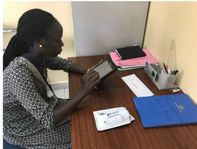
Photograph used with permission