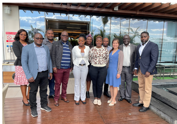
Zambian stakeholders participate in an assessment of the county's readiness for integration of lab services

During the last quarter, the LabCoP piloted the scorecard in five LabCoP countries: Zambia, South Africa, Eswatini, Zimbabwe, and Tanzania. The exercise aimed to determine the scorecard's ease of use and practicability. Each country's ministry of health's focal person convened a group of stakeholders who answered the questions by ASLM assessors. The stakeholders were mainly from the ministry of health laboratory directorate or equivalent, representatives from the public health department, civil societies, implementing partners, and others. The stakeholders appreciated the scorecard as a means of identifying areas of improvement for the successful integration of laboratory services. For example, a Zimbabwean stakeholder remarked that 'the tool is an eye opener on the need to look at the integration of laboratory services from the perspective of the patient'. Another from South Africa said that much work has gone into developing this tool to cover all aspects of integration of laboratory services.