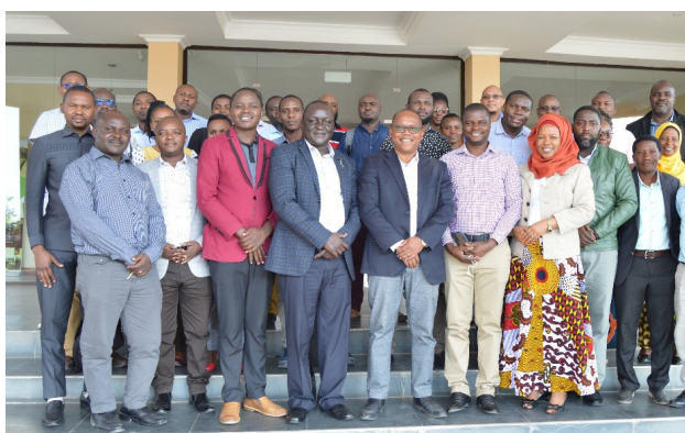
The Tanzania MoH team in Dodoma reviewed integration efforts through the application of the integration assessment tool

A previous assessment of seven LabCoP countries in 2021 revealed that some countries had piloted integrated laboratory services and could be reference points for other countries. However, there was no standardised way to measure diagnostic integration's success in improving access and health outcomes. A framework is thus necessary to guide countries in considering essential elements for successfully integrating testing services to improve access and health outcomes.