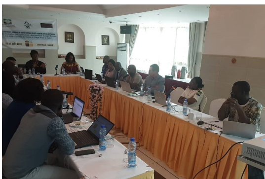
First Day Workshop Session Self-Evaluation

This self-assessment workshop is the second step in implementing LabCoP in Gabon. The first step was establishing a national multidisciplinary team after gaining acceptance from the Gabon ministry of health that will implement LabCoP activities.