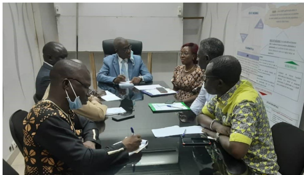
Visit from the health authorities: the Director General of Health and the LabCoP team

The workshop's objective was to assess the national laboratory systems that support the voluntary counselling and testing (VLT)-HIV cascade to identify the strengths and weaknesses of the overall laboratory system in Côte d'Ivoire.