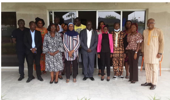
Family photo after the opening ceremony (self-evaluation workshop)

The workshop's objective was to assess the national laboratory systems that support the voluntary counselling and testing (VLT)-HIV cascade to identify the strengths and weaknesses of the overall laboratory system in Côte d'Ivoire.