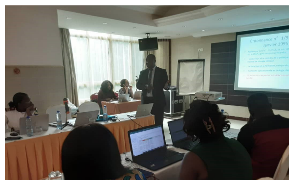
Presentation of the laboratory's system and network by the Director of LNSP during the Self-Assessment

The LabCoP will support the country team in developing a work plan based on the identified challenges. Then, the country team will implement the work plan to improve the function and quality of care provided by the laboratory systems while building on identified strengths, including increasing demand for result use and enrolling in external quality assessment. Hopefully, improvements will be shared during the upcoming LabCoP ECHO sessions.