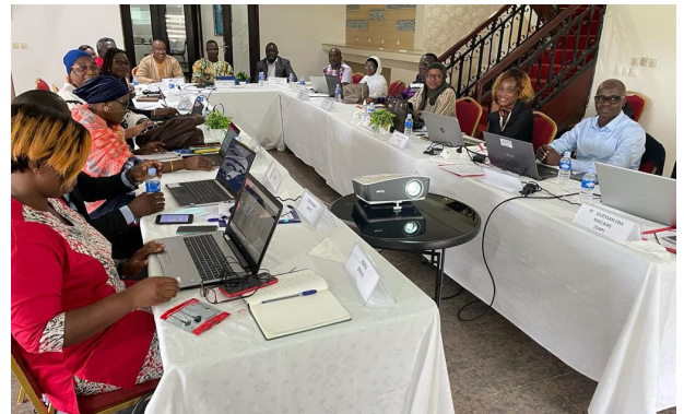
Working session (self-assessment workshop) in Abidjan, Côte d'Ivoire

From 20-23 June 2022, the medical laboratory systems self-assessment workshop was held in the conference room of Hotel Limaniya Golf in Abidjan, Côte d'Ivoire. The participating laboratories self-assessed the scale-up of the HIV viral load test. In attendance were the LabCoP management team, the main directorates in charge of medical biology laboratories (DGS; DAP; LNSP; IPCI; AIRP; NPSP; PNLS; PNLT; PNLP); and partners that support the laboratory system (the United States Centres for Disease Control and Prevention (US CDC), the US CDC Division of Global Health Protection (DGHP) and the US President's Emergency Plan for AIDS Relief (PEPFAR)).