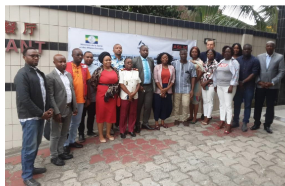
Family photo of workshop participants Self-evaluation

The challenges included: establishing a sample collection and transport system; developing a national laboratory input supply strategy; establishing a national quality control system; elaborating the national laboratories policy; and organising the data management system of the network of public and private VL laboratories