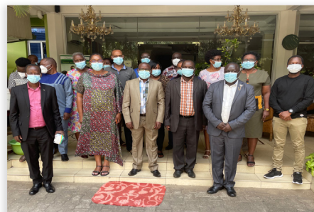
LabCoP Mgt team with Burundi LabCoP team during self-assessment exercise