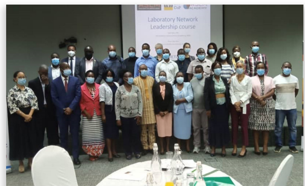
Zimbabwe's LabNetLead course participants