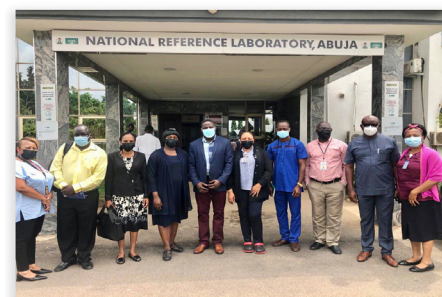
LabCoP Mgt team at Nigeria CDC laboratory in Abuja