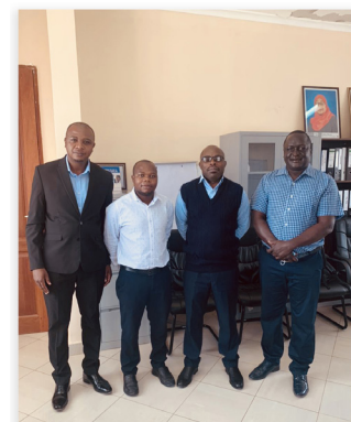
LabCoP Mgt team with Tanzania National TB Program Manager

Most countries were aware of the number and capacity utilisation of instruments within the country. All the GeneXpert instruments in Tanzania had existing maintenance contracts. At least two countries, Burkina Faso and Nigeria, possessed a geographic information system that maps laboratory capacity and can inform integration toward expanding population coverage for laboratory services.