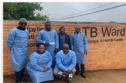
LabCoP Mgt team with Nhlanguano Tuberculosis Laboratory staff in Eswatini

While great effort had been made by these countries, none were conducting monitoring and evaluation of key indicators of integration, including cost savings, population coverage of testing services, testing levels across diseases/programmes, and the number of evidence-based clinical management cases. LabCoP is developing an Integration Readiness Assessment tool, based on the capability maturation model, to assist countries to self-assess their progress toward diagnostic integration. LabCoP also intends to facilitate the sharing of best practices for optimising integration services and update the decision-making matrix for the improvement of integration services.