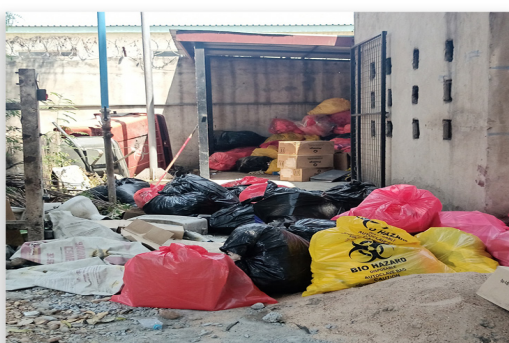
Stockpiled chemical and biological waste at the National Public Health Laboratory, South Sudan

Diagnostic testing produces potentially hazardous biological and chemical wastes, of which improper management poses significant safety risks to staff, the public, and the environment. Therefore, a structured and effective waste management system at national and sub-national levels is necessary, including developing and consistently using comprehensive waste management guiding policies and procedures and the availability of waste management facilities and trained staff.