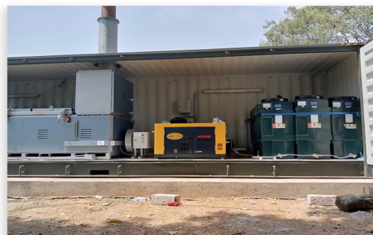
A section of the fully installed and commissioned high capacity incinerator

assessed, completed the installation of and commissioned the new incinerator; repaired the faulty motor of the old incinerator; trained one site engineer and five other waste handlers in the proper operation and maintenance of the incinerator; and conducted a general waste management training session for the waste management technical working group.