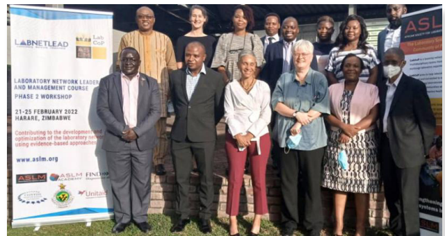
LabNetLead trainer-of-trainers course participants with the DATOS Team

The LabCoP piloted its laboratory network leadership (LabNetLead) course in Zimbabwe between 21 and 26 February 2022. The LabNetLead course introduces essential concepts and activities to design, optimise, lead, and manage functional, high-quality laboratory networks. The system is part of the African Society of Laboratory Medicine's (ASLM) Laboratory Systems Strengthening Community of Practice (LabCoP) program that focuses on human health laboratory network management.