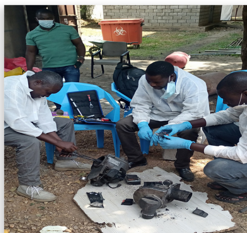
The engineers repairing the motor of the old incinerator

The LabCoP Management team consulted other LabCoP country teams and identified a Zambian healthcare waste management team from within the Ministry of Health with incinerator installation, maintenance, repair, and modification expertise. With support from ASLM, the Zambian team visited South Sudan, provided technical assistance, and restored the country's central laboratory's incineration capacity. Specifically, the Zambian team: shared customisable standard operating procedures, guidelines, and job aids for the operation and maintenance of incinerators with the South Sudan team;