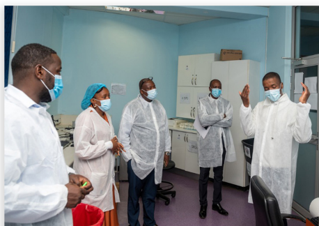
LabCoP Mgt team tours the National Molecular Reference Laboratory in Mbabane, Eswatini

At least four countries had developed or expanded their integrated specimen referral system to support testing. Clear guidance on testing prioritisation was also available in two countries: Tanzania (tuberculosis>COVID-19>early infant HIV diagnosis>viral load) and Burkina Faso (COVID-19>tuberculosis>early infant HIV diagnosis>viral load). One stakeholder from Nigeria indicated that supporting systems for integrated testing needed to be addressed to maintain testing targets for integrated tests.