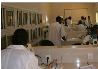
Figure 1: Formation des personnels.

La Direction des Laboratoires a pour mission principale d'élaborer et de mettre en œuvre une politique des laboratoires au Sénégal ; elle doit aussi appliquer les textes réglementaires, tout en continuant à s'occuper des aspects