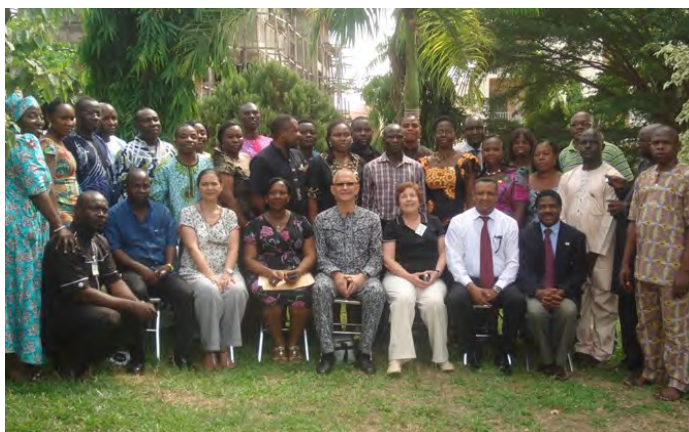
Participants at the closing ceremony of the Abuja QMS ToT Workshop.