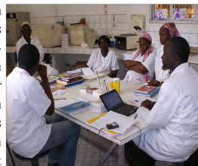
Figure 2: Supervision de laboratoires.

Il s'agit d'activités de formation des personnels de laboratoires selon un format intégrant les différentes disciplines biologiques, et associant exposés théoriques et travaux pratiques (figure 1). Les laboratoires font aussi l'objet de supervision formative permettant aux biologistes de vérifier sur site la bonne réalisation des analyses et d'accompagner le personnel au travail (figure 2) Pour vérifier et améliorer la qualité des analyses, des sessions d'évaluation externe de la Qualité sont organisées avec l'envoi d'échantillons et de lames à analyser dans les mêmes conditions que les spécimens biologiques.