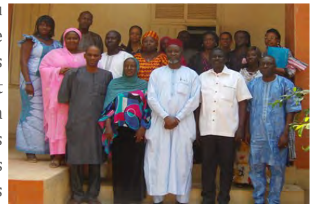
Figure 3 : formation d'évaluateurs SLIPTA.

Le déploiement du logiciel de gestion de laboratoires acquis grâce au projet RESAOLAB est en phase de test dans quinze laboratoires après formation des utilisateurs qui ont