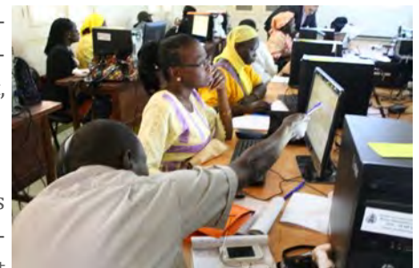
Figure 4: Formation à l'utilisation du logiciel de gestion des laboratoires.

Au Sénégal, nous avons salué la naissance de l'ASLM et pensons qu'elle peut beaucoup apporter