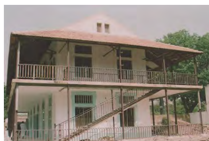
Figure 5: Chantier du Laboratoire national de santé publique.

aux laboratoires africains, et nous souhaitons une collaboration renforcée entre l'ASLM et les Directions de laboratoires ou Réseaux nationaux de laboratoires (RNL) des pays.