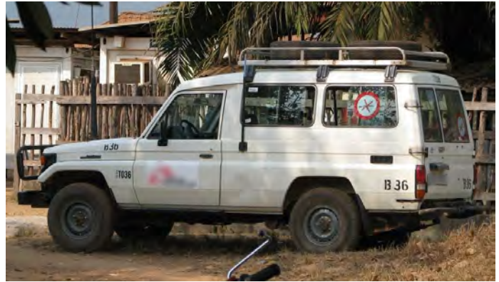
Organisations like Médecins Sans Frontières/Doctors Without Borders are often the first to arrive and last to leave conflict zones.